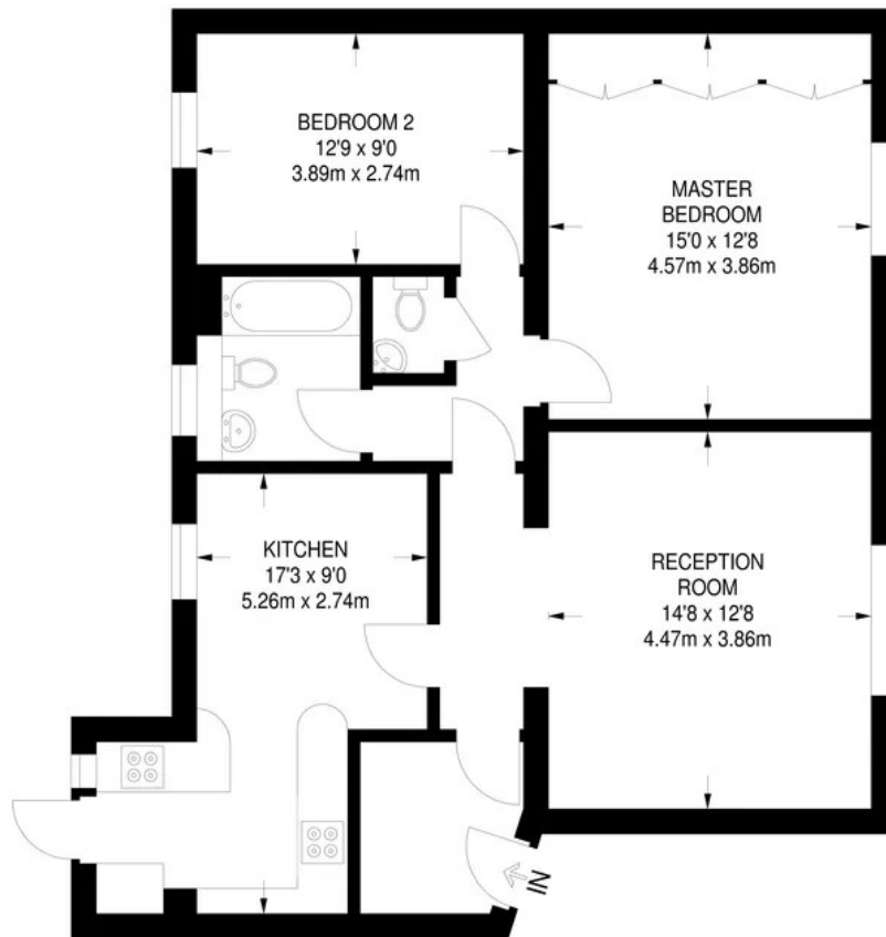
FIRST FLOOR 882 SQ FT / 81.9 SQ M